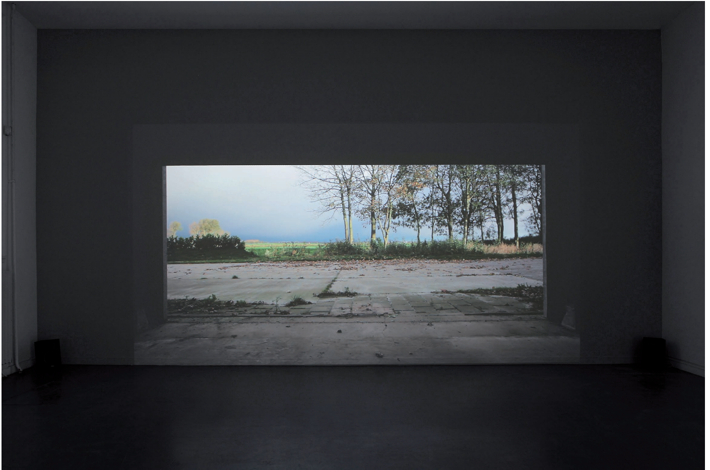
Exhibition view, Graduation Show Piet Zwart Institute Master Media Design and Communication Tent, Rotterdam 28.06.2013 – 25.08.2013